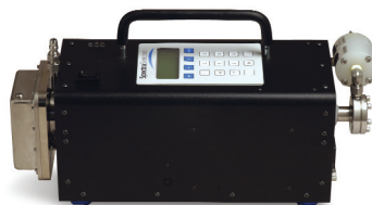
Portable Gas Analyzer