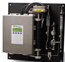
Sample Conditioning Panel